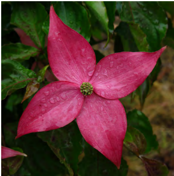
CORNUS KOUSA 'SCARLET FIRE®' DOGWOOD